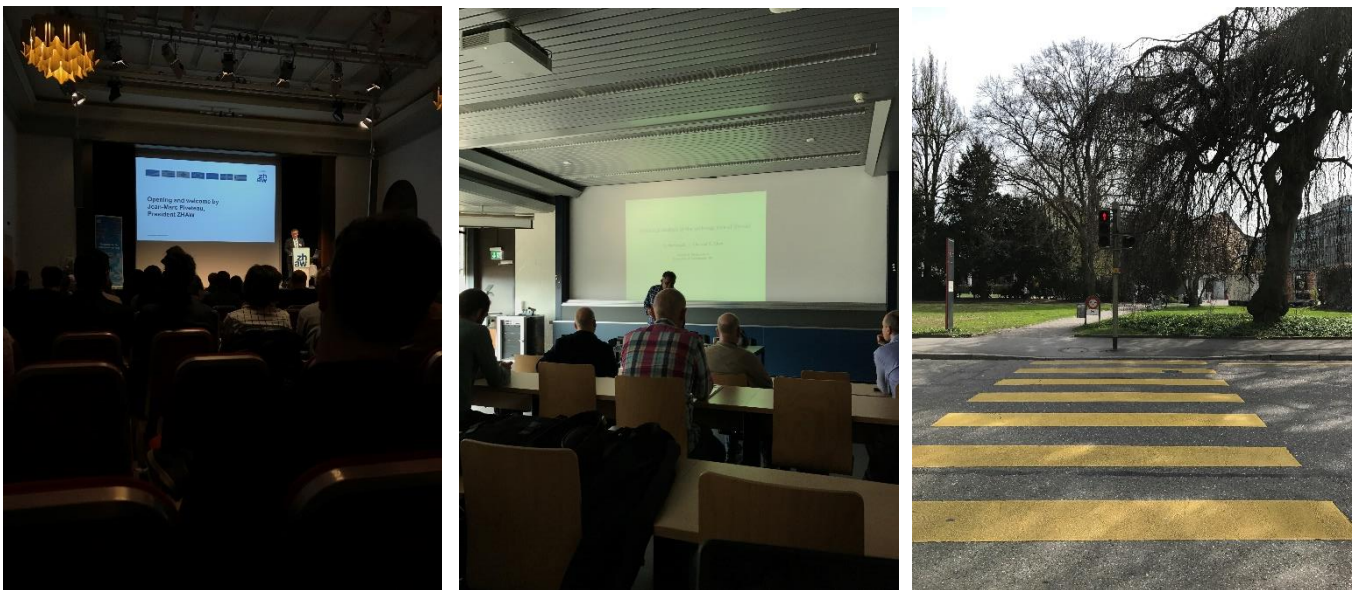
Left: International day event Centre: Presenting at the Internal Seminar Right: ZHAW University campus

Overall, we like to say thank you very much to the STSM committee for providing us with this STSM fund. Without this funding, it would not have been possible for the research and other activities mentioned above to be accomplished so efficiently and successfully.